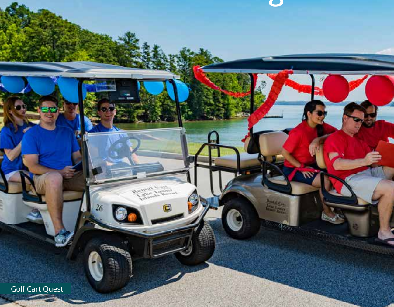
Golf Cart Quest