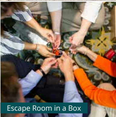
Escape Room in a Box